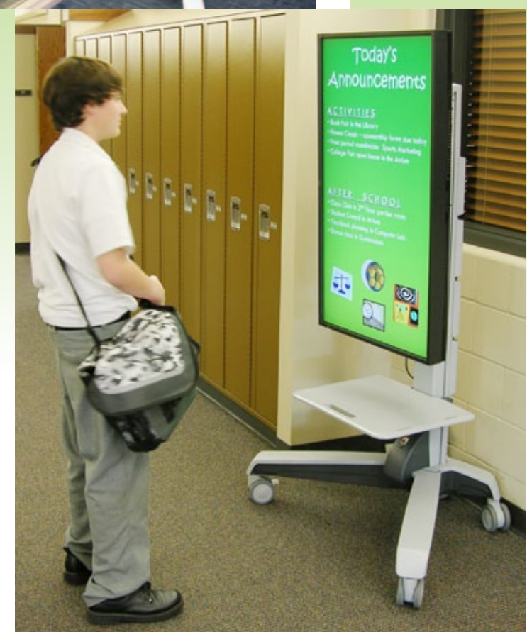
A flexible, economical tool for delivering wayfinding , signage and informational content throughout the campus.