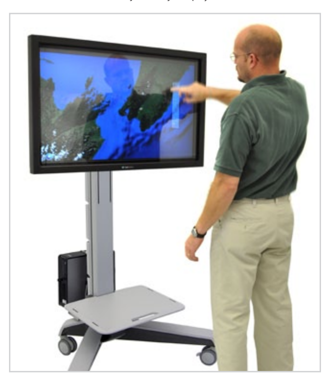
Mobilize touch displays and make them height-adjustable so everyone can easily interact with them.

Deliver classroom content dynamically and projector-free.