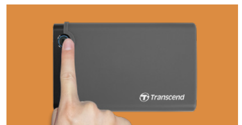
One touch for easy backup