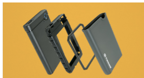
Shock absorbing rubber for rugged protection