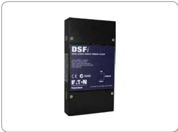
Series Filter with Shunt Surge Diverter, 1 Phase 5-32A, 40kA Primary

Class II/Cat B & A, Single Phase High Performance Surge Filter