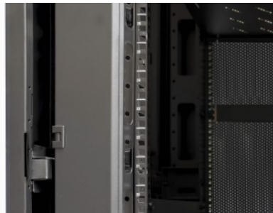
Vertical Cable Management Rails Opened