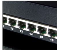
Distance Extension – Up to 40 m via Cat 5 connection