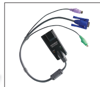
Multiplatform Support – KVM adapter cables allow flexible interface combinations